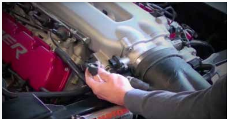
Disconnect the throttle cable from its tab by pulling forward on the black cable end.