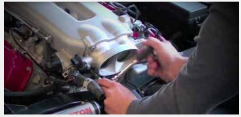
Remove the 4 bolts that hold the throttle body to the intake manifold.