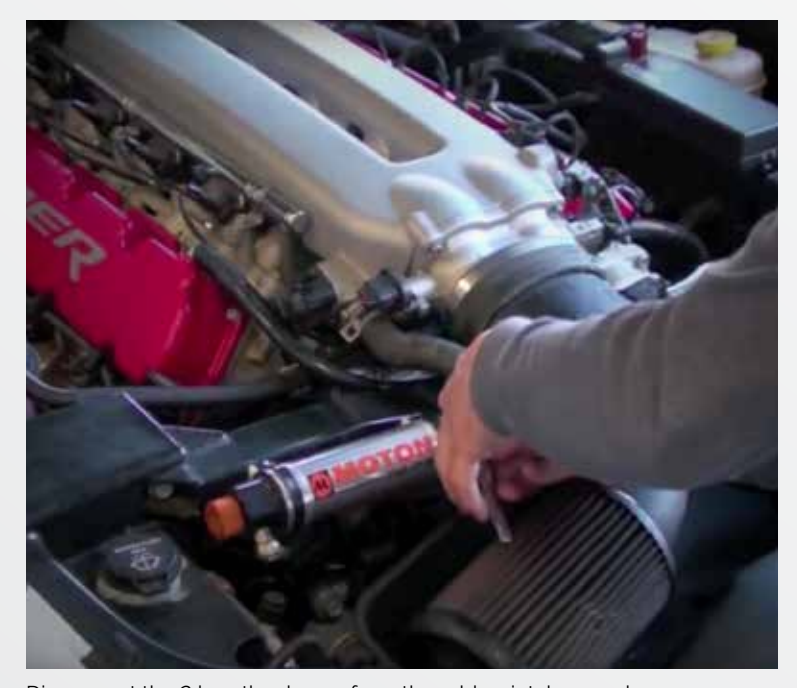
Disconnect the 2 breather hoses from the rubber intake coupler.